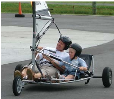
Shredder and Son